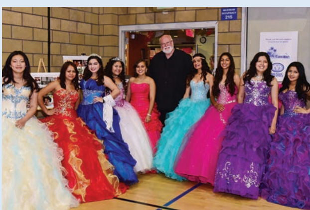
Washington United Youth Center celebrates 15 years!