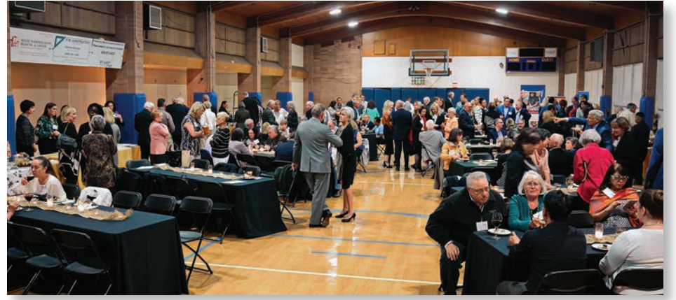
It was a packed house in the St. Lucy Parish School gym for our beautiful Caritas reception.