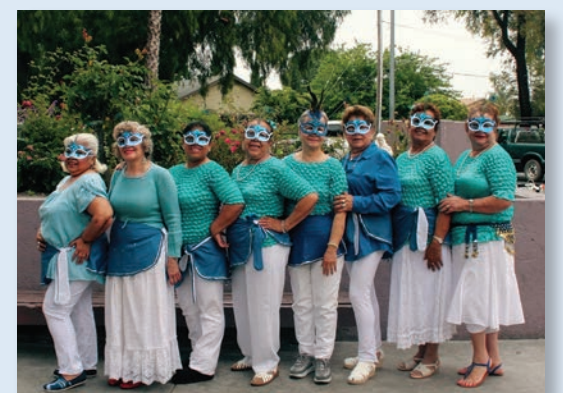
Grupo Por Vida performs during Cinco De Mayo at Eastside Neighborhood Center.