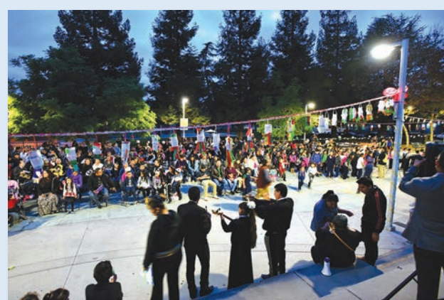
Washington United Youth Center's Annual Posada Celebration was created by the community for the community.