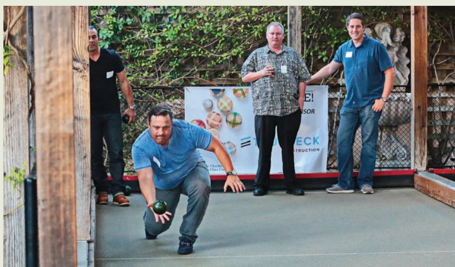
Team Bay Area Builders 'Roll Against Poverty!'