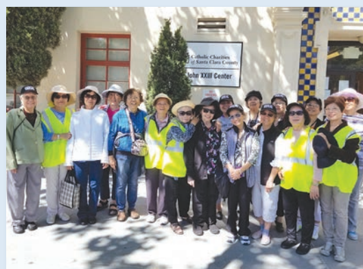
Seniors from the Walk with Ease walking group take a quick selfie in front of John XXIII Multiservice Center.