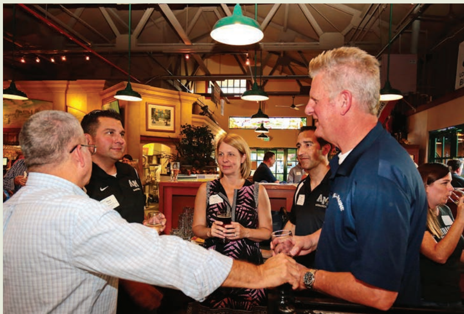
Representatives from the Archbishop Mitty "Mighty Monarchs" enjoyed friendly competition with Bellarmine High School's "Go Bocce Bells!" pictured here. Also represented at the tournament were Presentation High School and St. Francis High School.