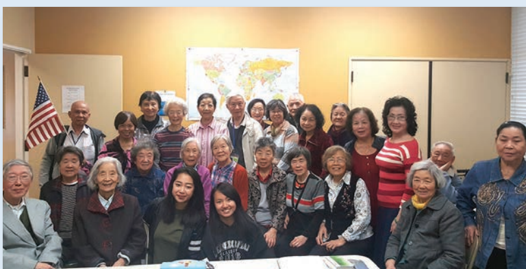
Students take a break from Citizenship lessons at John XXIII Multiservice Center.

EASTSIDE NEIGHBORHOOD CENTER, WASHINGTON UNITED YOUTH CENTER, JOHN XXIII MULTISERVICE CENTER