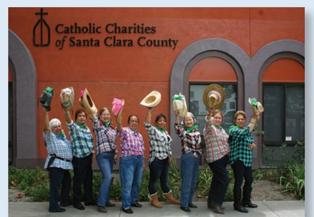
Eastside Neighborhood Center's Grupo Por Vida dressed up as cowgirls for a Vaqueros themed dance.