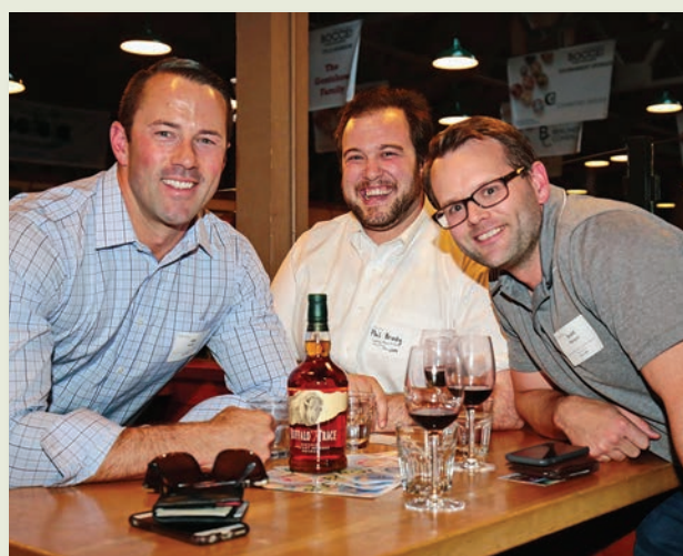
Enjoying wine and their take-home winnings from the Wine & Spirits Toss.